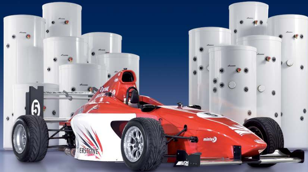
Greenstore SC Single Coil Cylinders